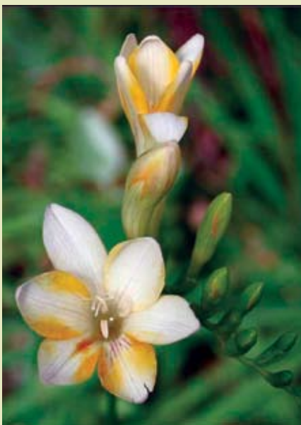
Freesia is a hardy South African native that will naturalize readily

The high demand for these two products in the past year has doubled in demand. This is good news because it indicates two things, it works and gardeners are seeking out more environmentally friendly alternatives to solving garden pest problems.