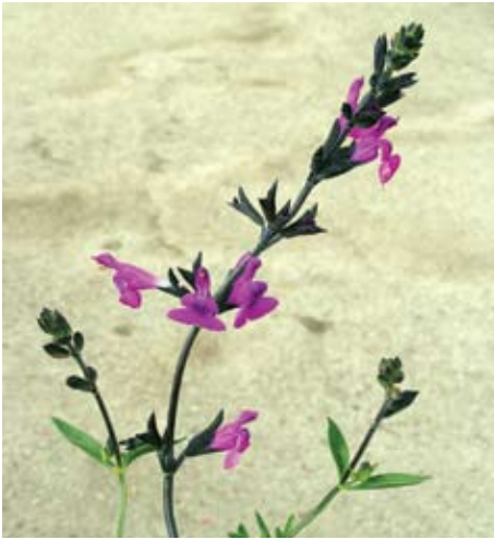
Many perennial salvia varieties have a long bloom season