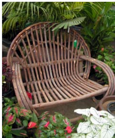
Seating areas invite garden reverie

Another approach to garden decorating is start with the biggest, or furthest item, that being the backdrop, and work your way forward. Choose tall, constant plants or trees that look good year round, they are the walls of the room. Carpeting, wood or tile floors are replaced