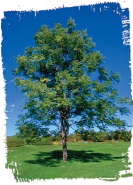
Deep watering builds stronger root systems and healthier trees