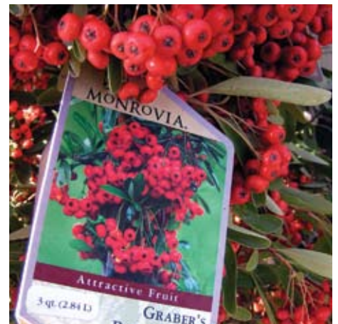
Graberi is 'berry' productive!

Other berry producing plants for an automatically festive landscape are the season's natural choice: holly or consider, barberry, cotoneaster, strawberry madrone, toyon and Oregon grape holly. Stretching the limits of berries regarding size, the ultimate ornament tree must be the persimmon. We have these trees in stock as well!