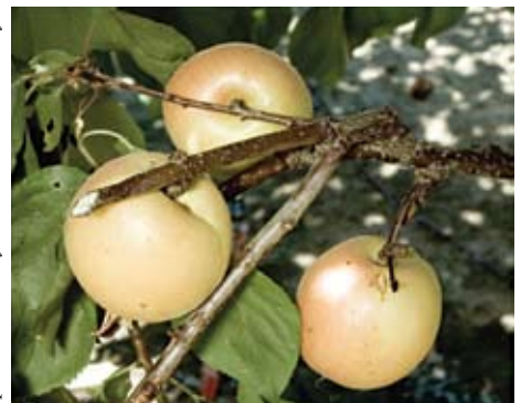
'Cotton Candy' Aprium is now available at Bokay Nursery