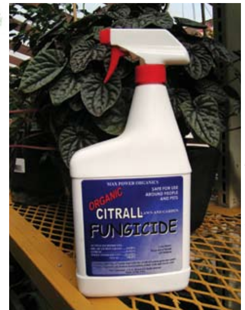
Citrall Fungicide is a non-toxic alternative to copper sprays

Ask the friendly staff at Bokay to direct you to these easy-to-use and effective products.