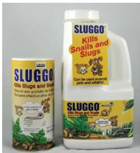
Sluggo is pet friendly and works!

more are common for experienced gardeners as well as those who tried it out for the first time. No need to be discouraged unless you have vowed to give up, otherwise there is great hope for this year's garden to be improved. Start this year with products that help prevent lots of problems; 'Sluggo', 'Deer Scram' and 'Citrall Fungicide.'