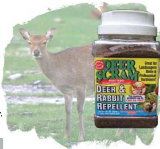
Deer Scram will keep four-legged nibblers away

So all the begonias has big brown spots on the leaves, the apples didn't ripen, the flower bed had more weeds than flowers, the zucchini was rotten on one end, the wisteria didn't bloom and the roses had mildew. These problems and hundreds