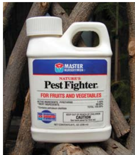
Pest Fighter is effective on many garden pests

than any of the new soils that have fertilizers added to them. This product gets its fertilizing capabilities the good, old fash-