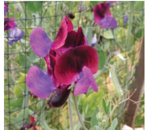
Sweet peas merrily climb the trellis

When choosing a flowering vine there are certain questions the nursery staff will be asking you before they make a recommendation: How tall would you like it to grow? Is the location in hot, full sun or somewhat shaded? Would you like a vine that rapidly covers or hides something? Will you mind some maintenance pruning? There are so many possibilities that include the fruiting kiwi vine, climbing roses, the exotic passion vines, the unbeatable fragrance of jasmine or the artistic shape of a wisteria to begin the list of possibilities.