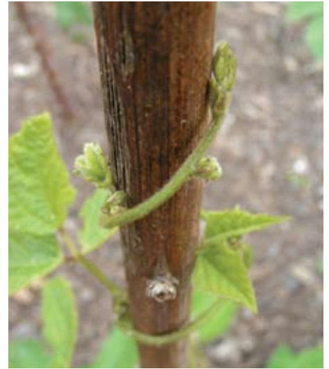
Scarlet Runner bean pole ramble

At Bokay Nursery we try to carry a wide range of herbs, vegetable starter plants in season and seed as well as fruit trees and shrubs. No matter what size your gar-