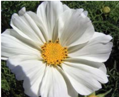
White cosmo lend delicate lightness

Choosing annual and perennials for great summer blooms are easy at Bokay because we get frequent deliveries of new stock and order from the best growers. For easy care and long bloom time consider Summer Phlox ( P. paniculata ). White blooming varieties of Phlox along with white cone flower, Shasta daisy's, white cosmos and the grey foliage of dusty miller or lambs ear create a glowing light, even at night.