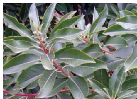
Shiny green foliage and red bark add year-round color

Plant an ice age survivor in your garden for a winter hardy, year-round beauty to enjoy, even with a name like Arbutus!