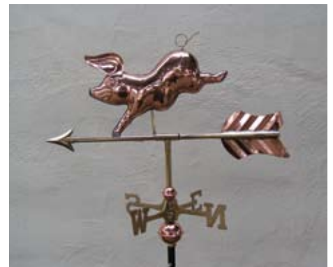
Pigs can fly! - when they are weather vanes. New offerings at the Nursery.