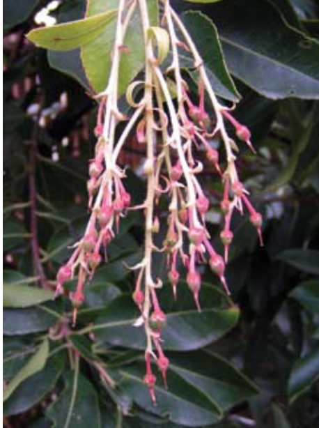
Creamy urn shaped flowers are followed by forming "strawberries"

This is all interesting trivia but BOKAY NURSERY wants you to know more. The nursery has always carried a great selection of Madrones because they are a hardy plant that thrives on neglect. They are versatile in form, attractive year round and do not care for fertilizers